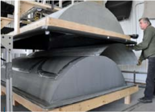
Vaness of varying sizes can be made on common tooling. ■

in 3-, 5-, 10-, 15-, 30-, and 50-kW capacities (and might go larger). Each MVAWT's vanes have a unique size and sweep. Further, the sandwich design cannot be produced via injection molding and is not easily achieved in conventional compression molding, because of its size, complex curvature, and the risk of core crush. Although the company hopes eventually to produce vanes in large quantities, it is currently cost-prohibitive to cut metal tools for each shape/size combination. That and the fact that the sandwich panel thickness was to be determined during the prototyping stage led to the selection of differential pressure molding (DPM), a process developed by Jack Van Ert, president of Vantage Technologies Inc. (China Township, Mich., see "Learn More").