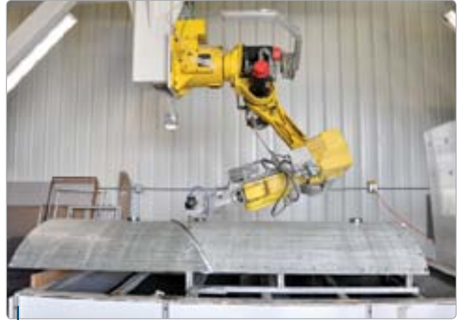
Vane sections are cut from the molded sheet, using a waterjet. ■

Van Ert's process allows subtle adjustments to be made to the curvature of parts coming out of the same tool, allowing him to adjust sweep on the fly. He produces parts for the 15-, 30-, and 50-kW vanes on one set of tools and molds parts for the 3- and 5-kW turbines on a second set. Parts for the 10-kW vanes can be molded on either tool. Thus, DPM and two sets of composite tools provide far greater design flexibility than matched metal dies could, but cost orders of magnitude less. Further, the process is portable and can be set up easily in developing countries. Although Van Ert will mold